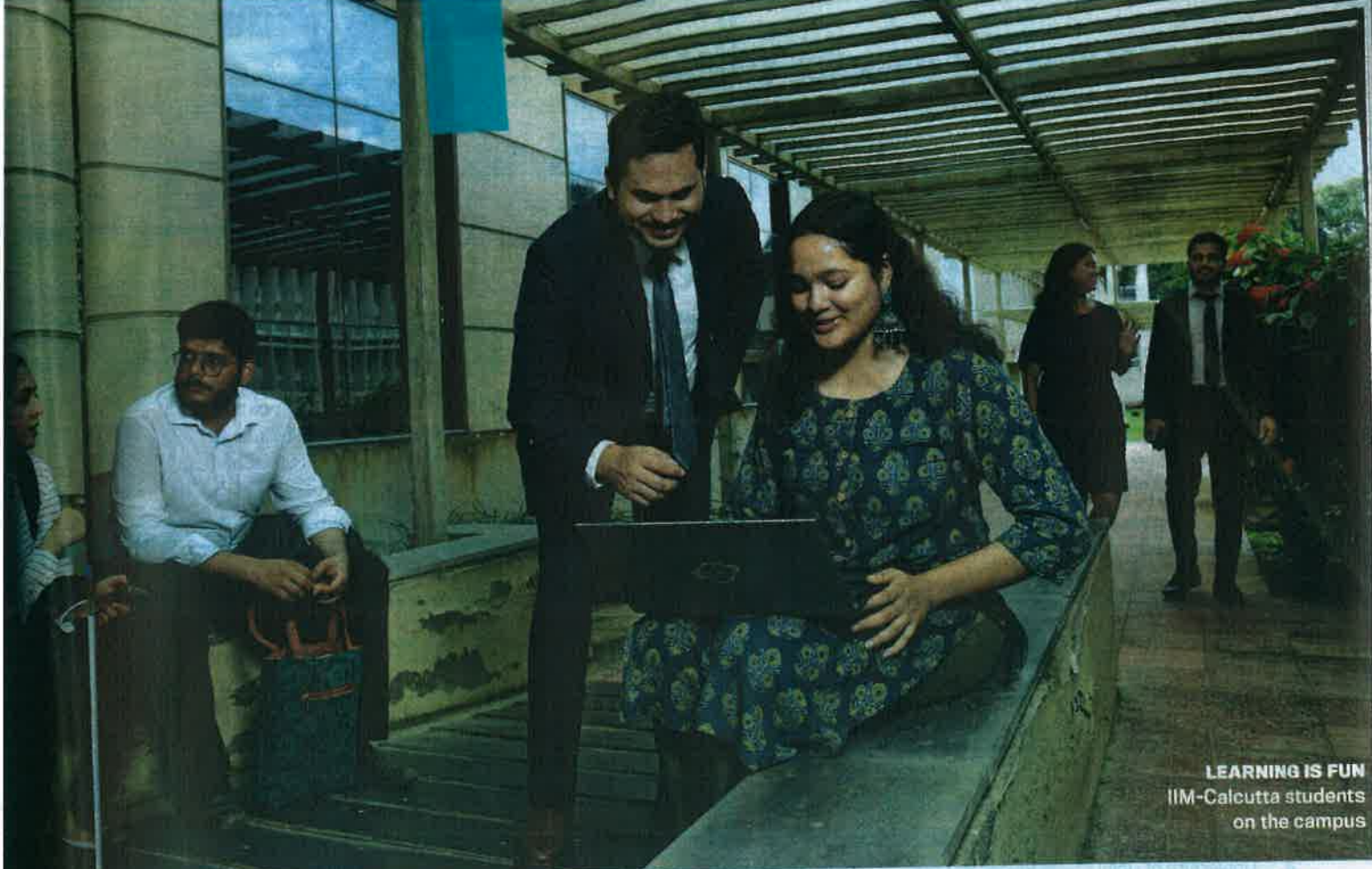
LEARNING IS FUN IIM-Calcutta students on the campus